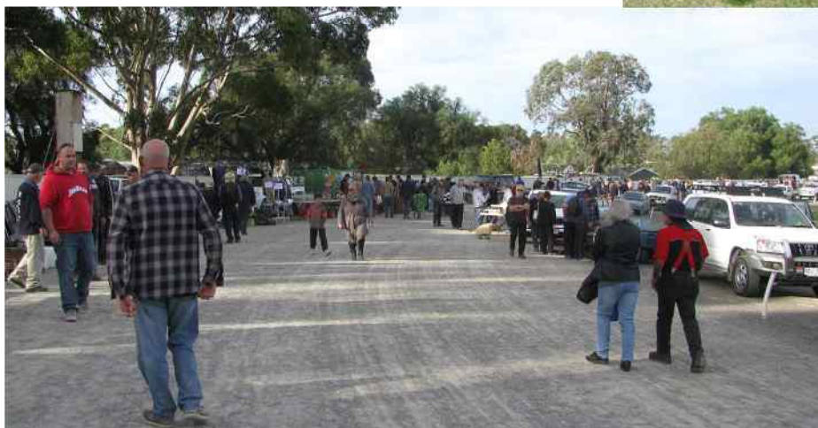
Kapunda Swap Meet