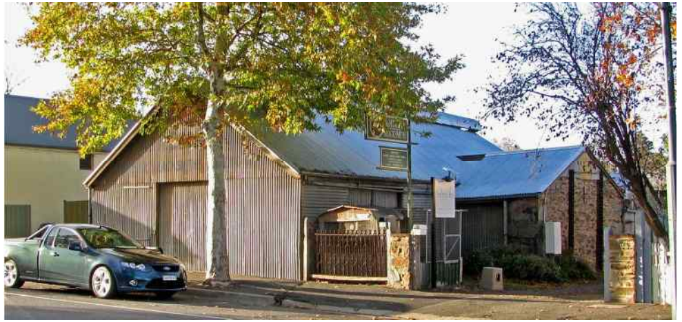
The Blacksmith Shop