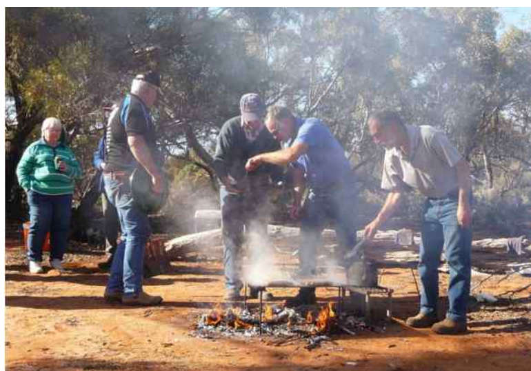
Cooking (or smokin') lunch