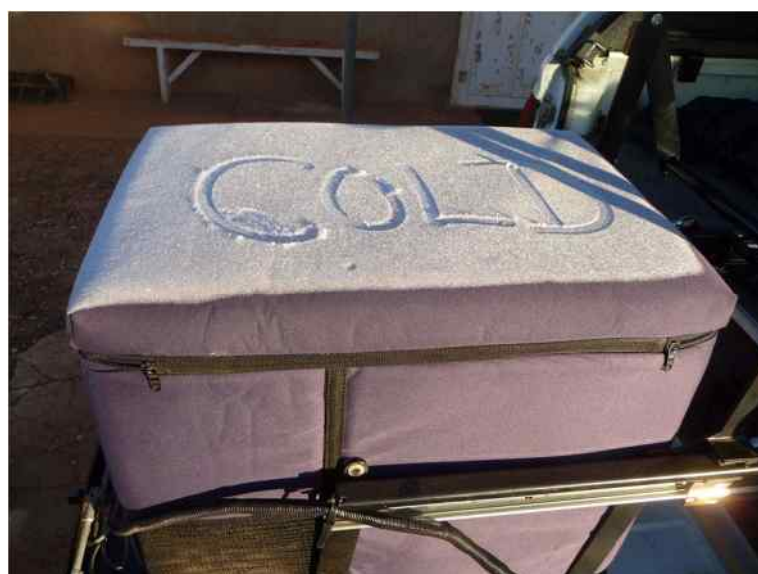
Who needs a fridge?