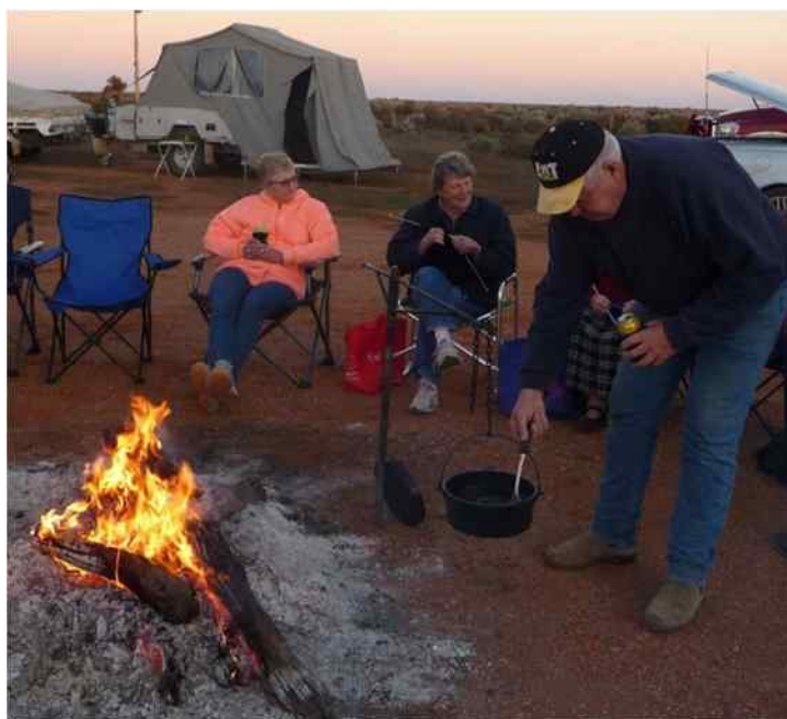
Cossy the chip king