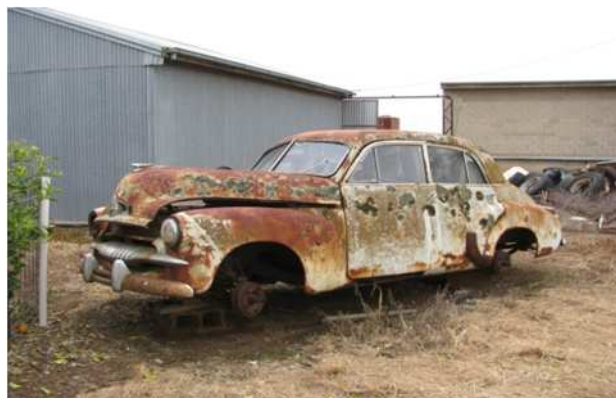
1954 FJ as found 100% complete