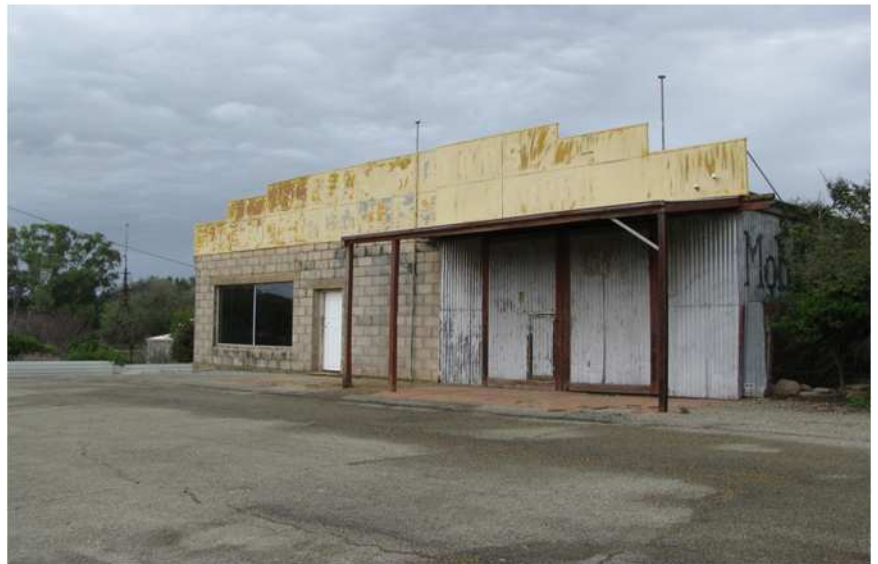
Before work commenced

From the start this was going to be a long term project allowing myself only one or two days a week to do the work required. Craig Goss removed all his stored gear from the shed and cleared the block (many thanks). Now I could start gutting the inside, dirt, rubbish, wiring, piping (air & water) broken windows, timber offices, shelving, trees and their massive roots were removed. Next came the stripping of all the rotten and white ant infected timber, enough, that we had a huge bonfire. Main posts that needed replacing were done with second hand ones, fitted with specially made steel saddles set in concrete footings. Three RHS steel main support posts replaced the original timber ones for strength and fire prevention. New glass & skylights, new plumbing and rewired. Only major work to be done is the rusty iron sheets on the roof. Half the block has been divided off, setting out for stalls etc. Landscaping started early and over twenty trees and shrubs have been planted so far. Galvanized fence posts are in place, new fascia boards, gutters & down pipes fitted.