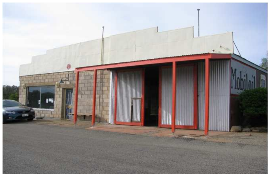
Progress to date