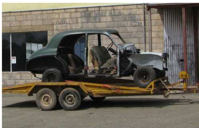
1952 48/215 FX partially restored