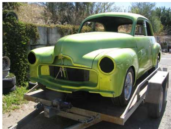
1954 FJ after painting