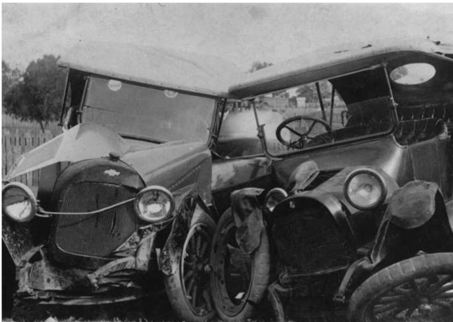
A Dodged Chevrolet (or is that not dodged)