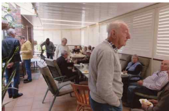
Morning tea at Osbourne's