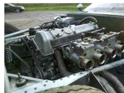
FWB engine in a Lotus 11