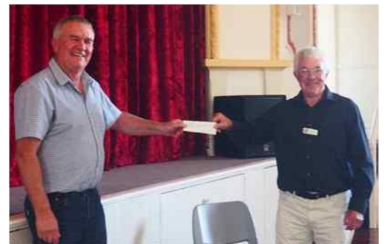
good social distancing at the cheque presentation