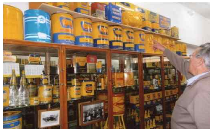
The Lutze Collection