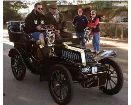
1904 De Dion