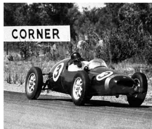
Brabham T41 1957 Australian GP