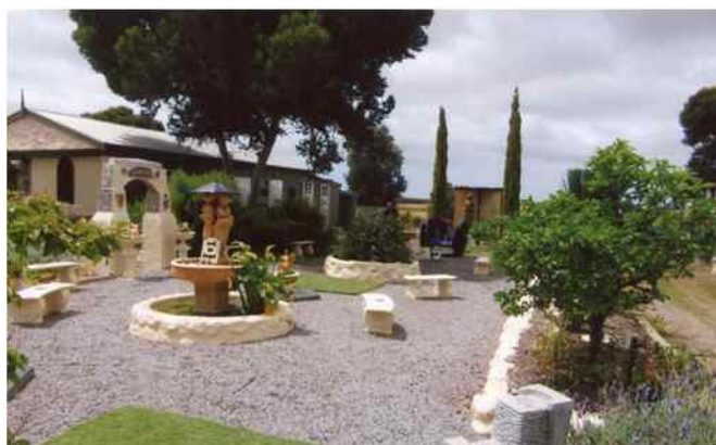
Memorial garden at Military Museum