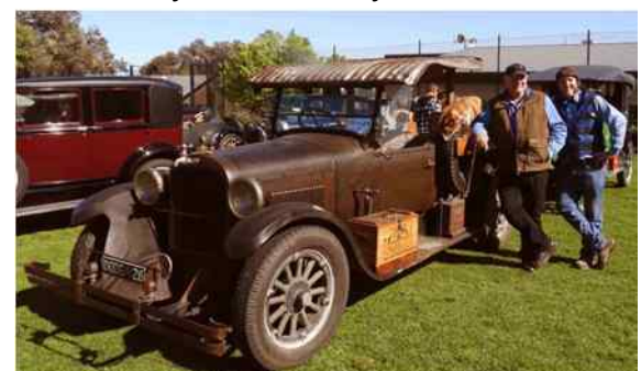
Nick's 1926 buckboard