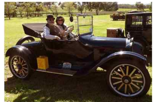
Nigel's 1919 roadster