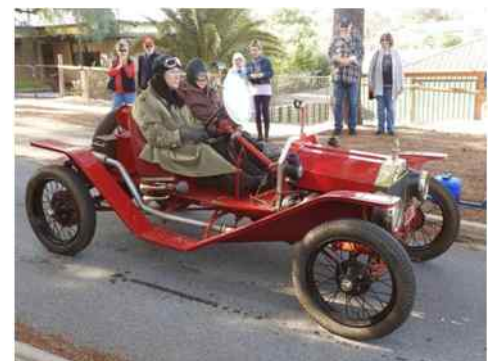
1915 Ford T racer