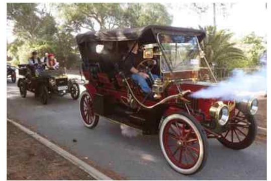
1909 Stanley steamer