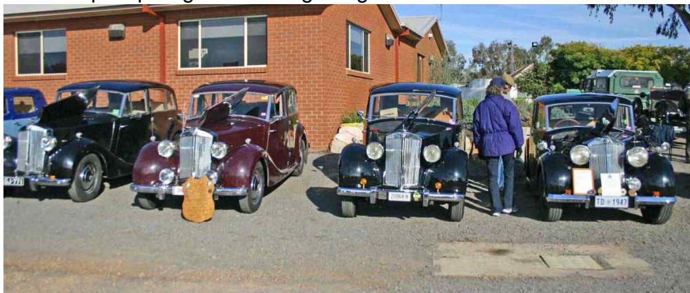
The four razor backs

Sunday was an even earlier start, the organisers wanted as many cars as possible at the raceway by 8am. There was ice on the roof of the Triumph and it was reluctant to start but after a wipe of the inside of the distributor cap it sprang into life. Light fog awaited us when we left the motel, in one patch visibility was almost zero, but it was only a short stretch and by 9am the sun was shining through with the promise of staying with us for the day. A fourth razor edge arrived from Melbourne to make the full compliment- our 1947 model, 2 1950 models and 1 1951 model, as well we were joined by a 1938