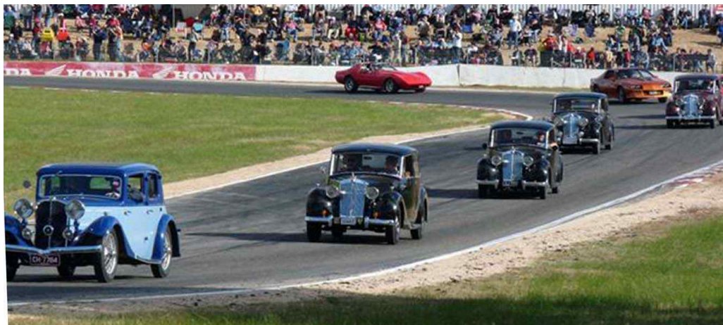
1938 Gloria and the razor backs on the track

About 12.20pm we were summoned to line up in pit lane and the vehicles were then shuffled around to the organisers liking. At the appointed moment we drove onto the circuit behind the pace car (and had to stay behind the pace car all the way) as we drove past the commentator he was saying how rare the Triumph razor edge cars are these days. The size of the crowd