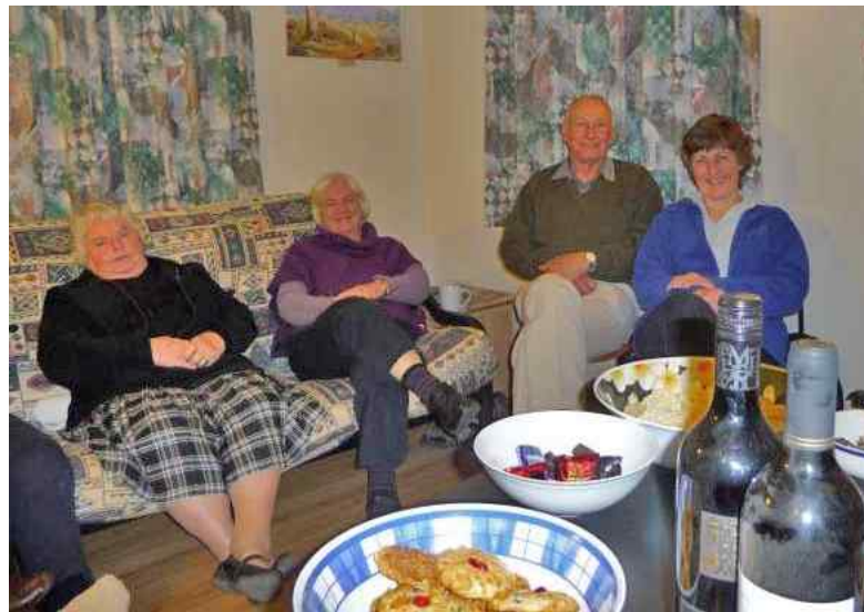
More healthy food!!