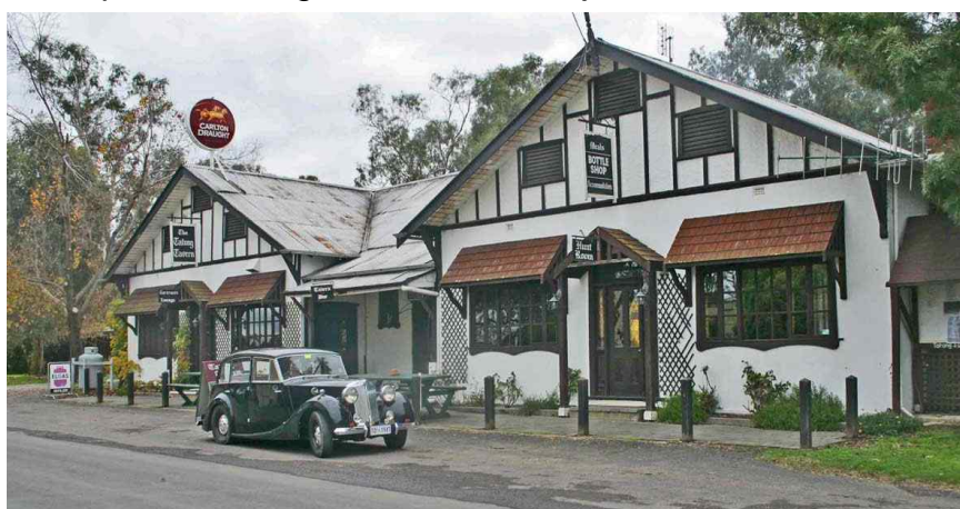
Totally English Triumph at Tatong Hotel

On Saturday morning we drove to Winton Raceway where we were directed to the designated parking area for display vehicles. There were three razor edge Triumphs there that day and we knew the owners of the others so caught up on news. Racing practice and time trials began early - about 8.45am so there was plenty of noise and activity around us. Races were organised for bikes and cars from 1920 onwards to 1980, why would you want to risk