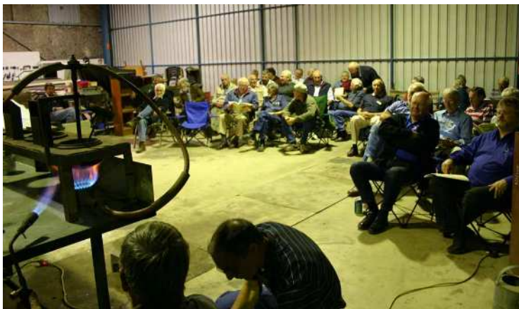
Members watch as metal melts

After about 15 minutes of heating the stock white metal reached 700 degrees Fahrenheit and was ready to pour. However it is first necessary to tin the parts. This is done by placing them in the molten metal to heat then spreading Allflux onto the desired surfaces