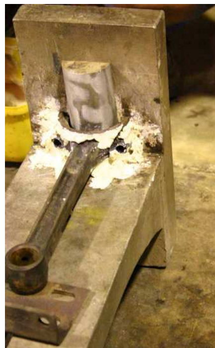
Puttied up ready for pour

The tinned big end was placed onto the casting block which had been heated to allow the metal to flow to all surfaces. The big end was puttied into place using a mixture of fire clay and flour! This is to prevent leakages and to ensure the metal stays where needed. This mixture was heated to set it. The workshop now smelt like a bakery.