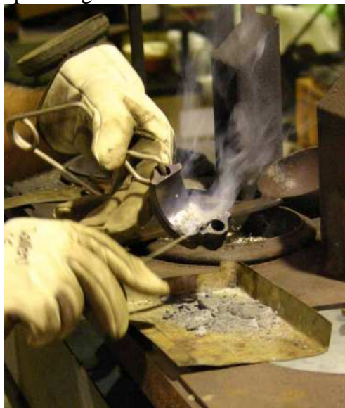
Tinning the big end

and then placing back into the molten metal briefly. A nice clean tinned surface should result. This was then washed to remove all traces of flux