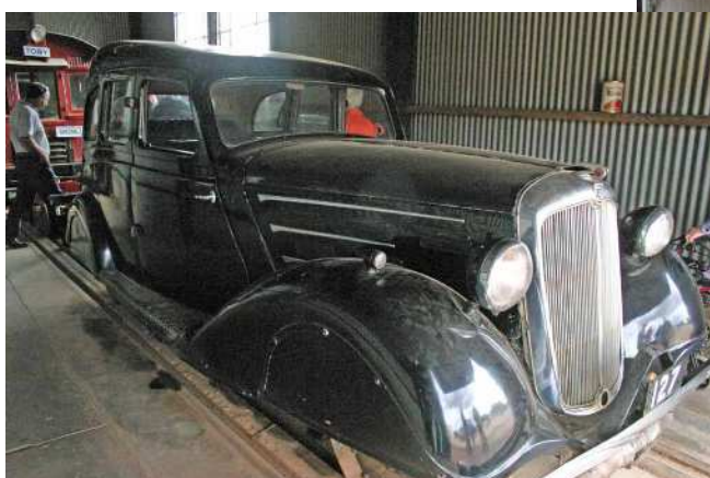
Morris pay car

Some of the members had lunch here and we then moved onto Steamtown. Their collection of trains and carriages is