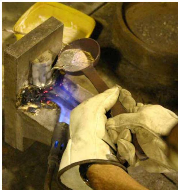
Pouring the molten metal