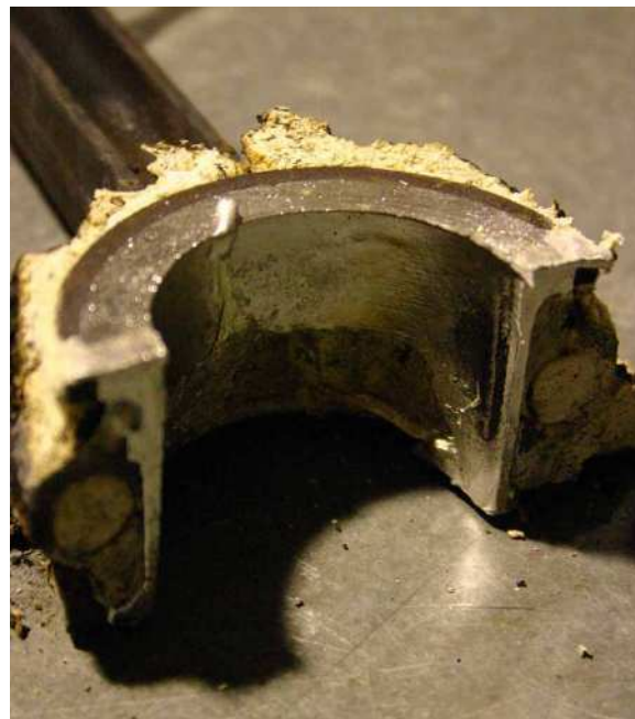
The completed bearing.