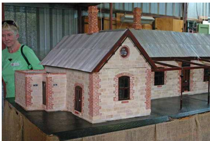
Scale model of Petersburg railway station

Just for a change Eldon decided to build a 1/12 th scale reproduction of the former Petersburg (Peterborough) railway station which was demolished about 40 years ago. He tracked down where the