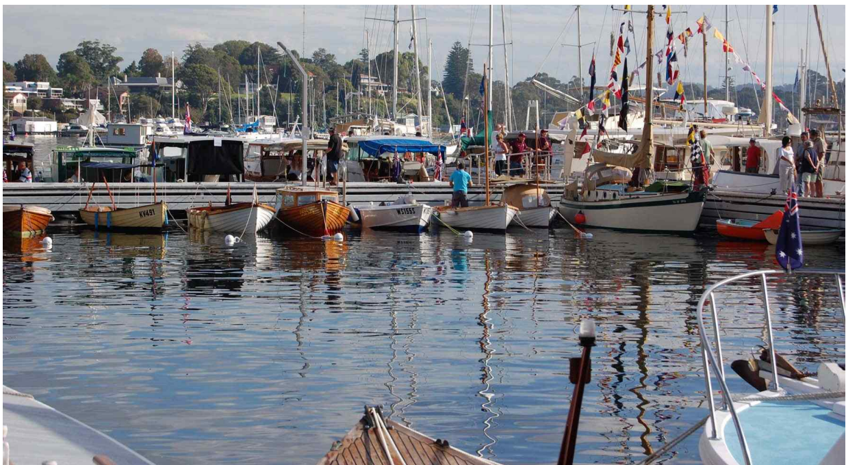
Clinka-Belle( 4 th from left) and the other boats facing us are in the local swimming pool. The moorings were secure and there was room for them all.

We launched the boats on a huge concrete area, the site formerly used for launching and landing Catalinas during WW2. There is a lot of history around here that is very interesting. We putted to Toronto, where the event was held, from Rathmines, where we stayed with friends. It began with a "Meet and Greet" on Friday night and continued next morning with enthusiasm of all old salts as they prepared for the days ahead. There were frequent putts around the bays that included an observation run. Kip and I went puttabout for a while and caught 4 fish on the snook line and that gave us bragging rights, as we did at Stansbury last year.