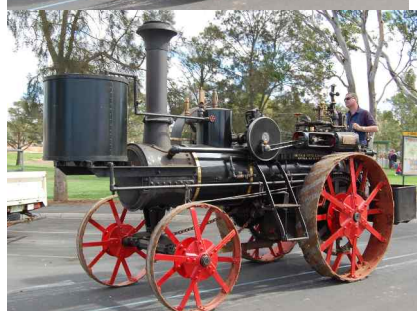
Top Burrell Below Buffalo Pitts Traction engines