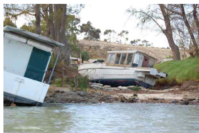
Boats stranded by low water