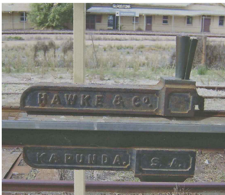
A bit of Kapunda in Gladston

We then visited the Melrose Museum and soaked up the local history. Following a very nice lunch at Bluey Blunstone's Blacksmith Shop we all headed for home.