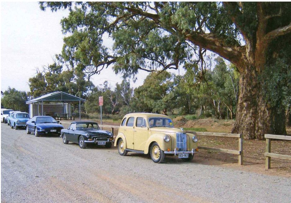
Giant Red Gum Orroroo ...claimed to be the largest gum in South Australia

Saturday morning we headed off to Wilmington where we visited the Puppet Museum and the Toy Museum. All very interesting. We found a Land Rover restorer in a side street. Eight registered out of thirty odd. We were invited to inspect the work in progress.