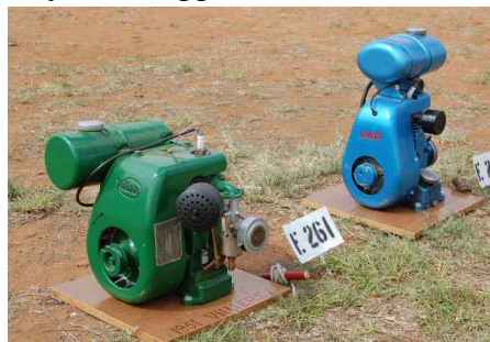
The NARC display .. A Villiers and A Jap engine entered by Kip

Friday it was all systems go as we cruised upstream to the rally site. More water here than we saw at Goolwa earlier at the SA Wooden Boat Festival but we pulled the boat up to the beach between cruises. We saw people we hadn't seen in years as we walked around and watched displays. There were lots of working displays to be seen and the parades were terrific. The "men" were like little boys with toys, only they were bigger.