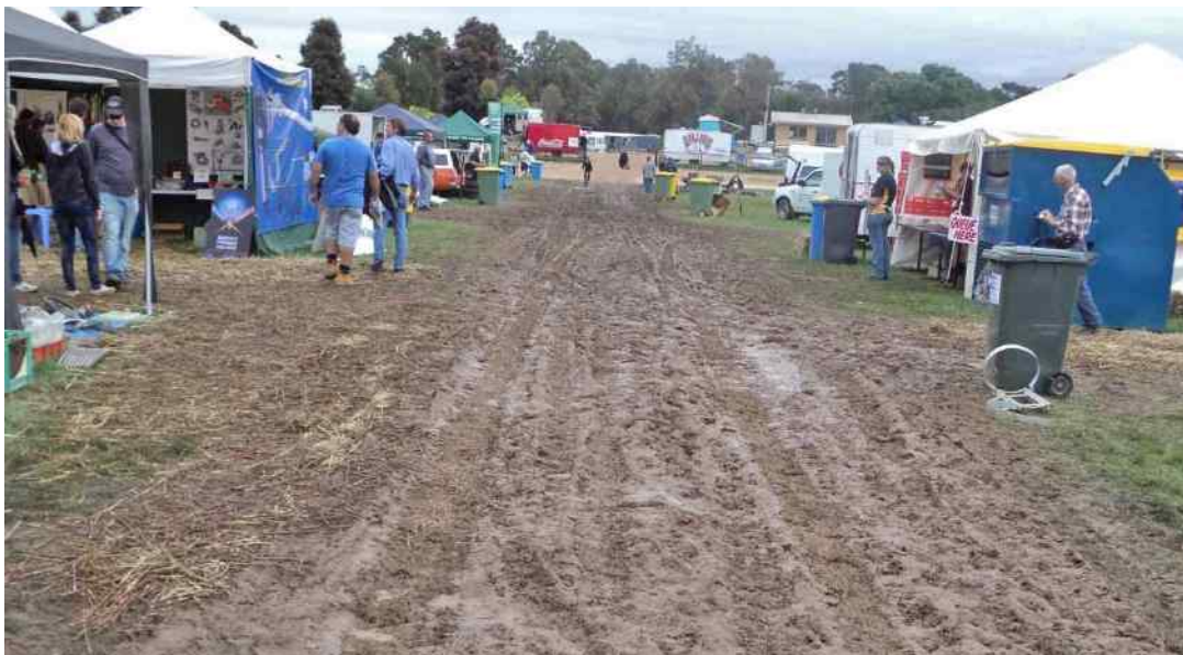
The road in front of the NARC site in the centre of the oval. This was about the best area on the grounds

A relatively early night followed so we could make an early start in the morning and on waking it was easy to decide that my motorcycling wet weather gear would be the most appropriate attire for the day. About 15mm rain had fallen overnight and there was clearly more to come.