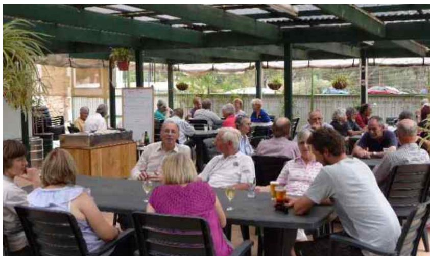
The outside dining area Redhill