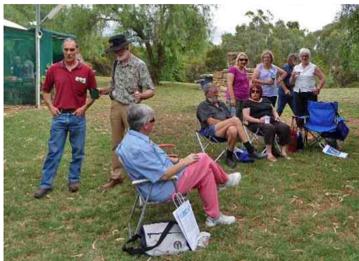
Morning tea Yackamoorundie Park, Yacka

Morning tea was held at Yackamoorundie Park on the bank of the river at Yacka, where the local community have set up a great collection of picnic tables, each mosaic tiled to illustrate a local story. Old pepper trees provided welcome shade and the breeze cooperated to keep us comfortable. Some took the opportunity to explore the old town buildings while the craft shop also received visitors.