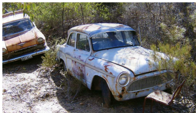
Fred's dream.....or nightmare