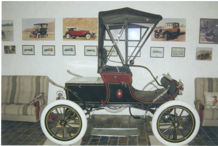
The completed car

The chassis is blacksmith forge welded and there are many parts held in place with rivets or square headed bolts and nuts. No spring washers (not yet invented). Reed horns, windscreens, wing mirrors, starter motors and electric car lights were also still to be invented..