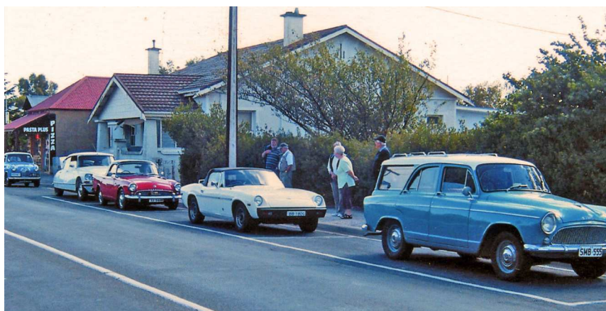
Parked in Lyndoch BELOW Just a few of many

There were vehicles of nearly every marque of varying ages and condition. Jaguars, Holdens, Fords, M.G., Triumph,