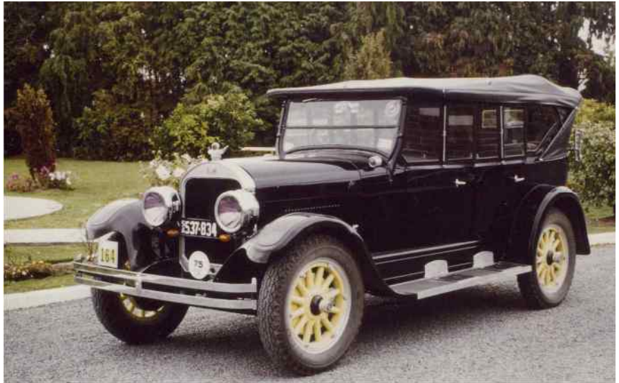
Flint at Rotorua Rally 1980

After picking the car up and clearing customs, we set sail for Rotorua, a distance of 150 miles. We also had on board with us, fellow NARC members Kip and Lynne Newbold.