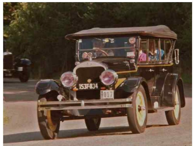
Flint in the Bay to Birdwood