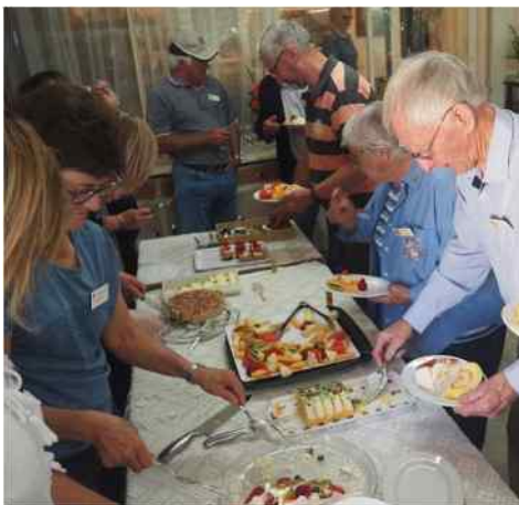
An array of desserts served by Kulpara Red Cross ladies

The food at lunch time was very good and an adequate supply, three clubmen cooked the meat, Kulpara Red Cross ladies supplied the salads and helped Claire. After the main course there Alan went around the perimeter of the room highlighting the function and variety of the various items which covered almost any aspect of life in times. While this was happening dessert was being prepared, a lovely variety to choose from and enjoyed. Oh what to choose!