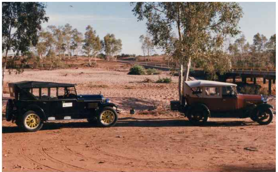
At Finke River