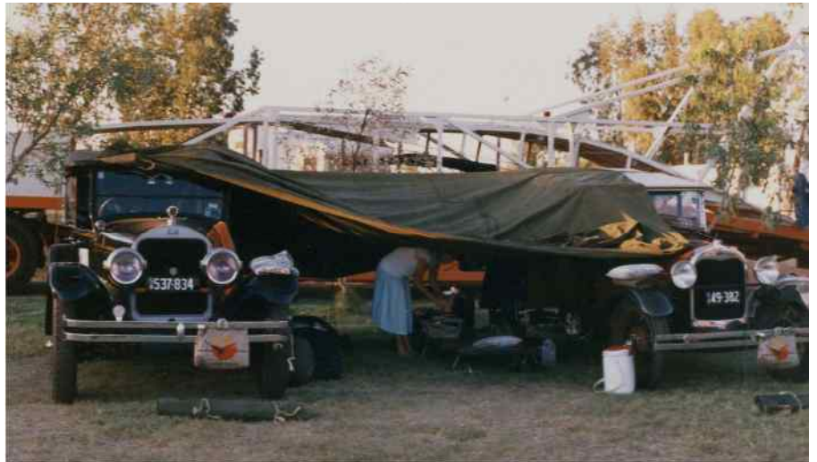
Three ways NT camp. Flint and Hunt's model A Ford