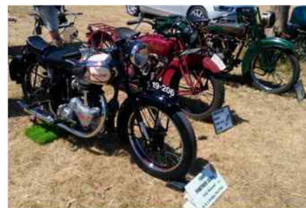
Motor Bike winner 1949 Panther from Pt Pirie