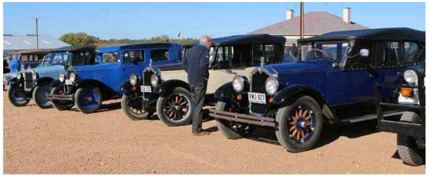
At The Gums