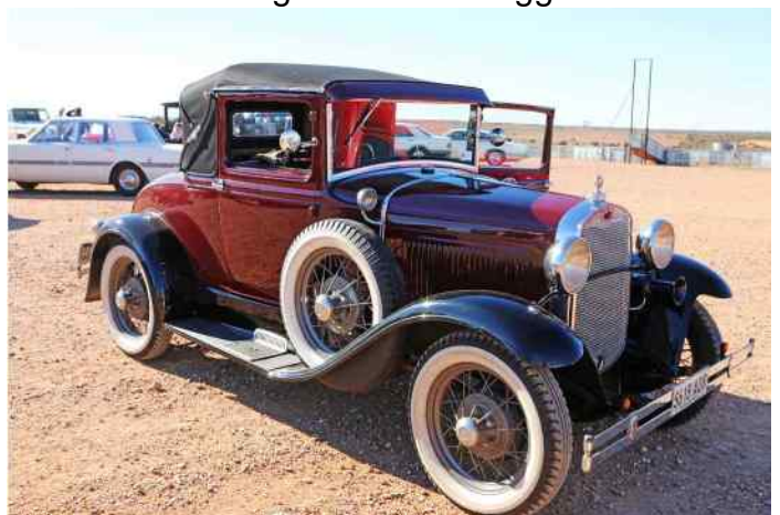
The Most Desirable