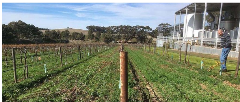
The Vineyard and winery