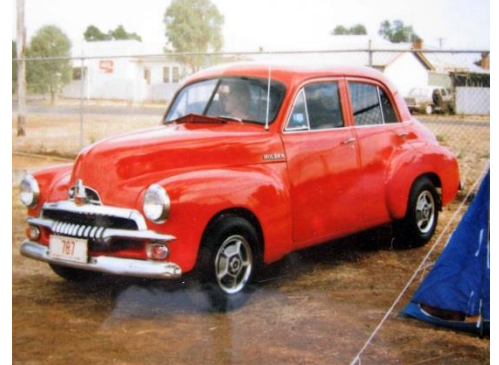
Campsite at Wellington