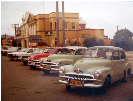
Main street Wellington

At the presentation night we were awarded with a trophy for travelling the longest distance to attend. Then