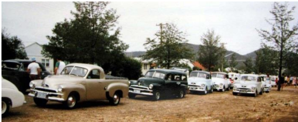
Lining up for Grand Parade

four day event, all this and with Robyn expecting.