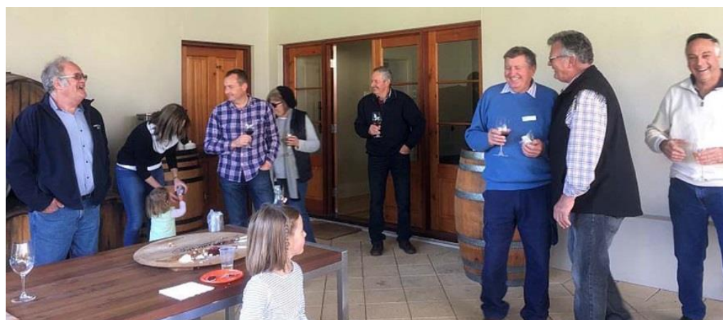
Very happy... too much wine tasting?

What makes this enterprise unique is that they follow Biodynamic Farming principles, with soil quality the primary focus. We were taken through the whole wine-making process by the family which has held the property since arriving in South Australia in the 1830's.