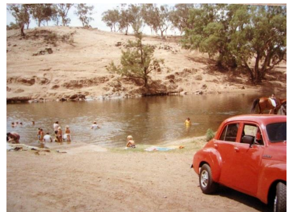
Swimming in the Macquarie River