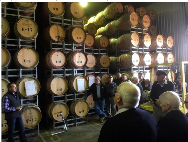
Kalleske barrel store

Barossa Farmer's Market on Saturday morning tempted most of our members with tastes and smells to die for, while the Tanunda bakery did well at lunch time. Saturday afternoon found many of the women inspecting the shops, while the true car enthusiasts joined the menfolk