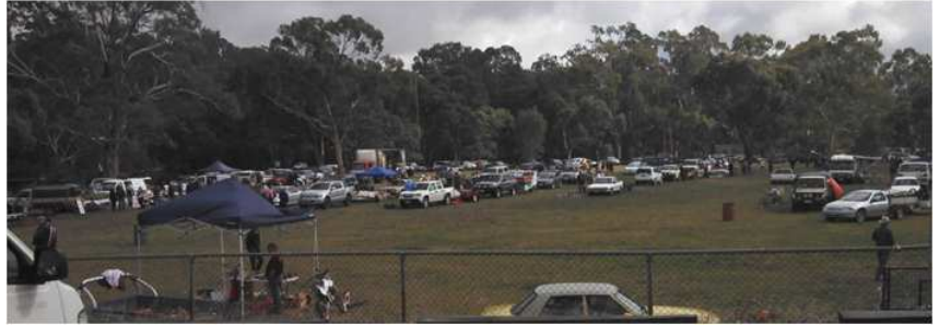
A very sparse oval!!

Sadly, the weather God was not kind on the big day into which so much planning and organizing had been delivered by so many to ensure (as far as possible), success! Remembering my last "brave"? effort when I volunteered to help on the early shift I stayed overnight as a well-looked- after guest at our Chairman's wonderful "Wolta Wolta" following a Saturday's bowling at Watervale and was pretty pleased with my pre-planning.