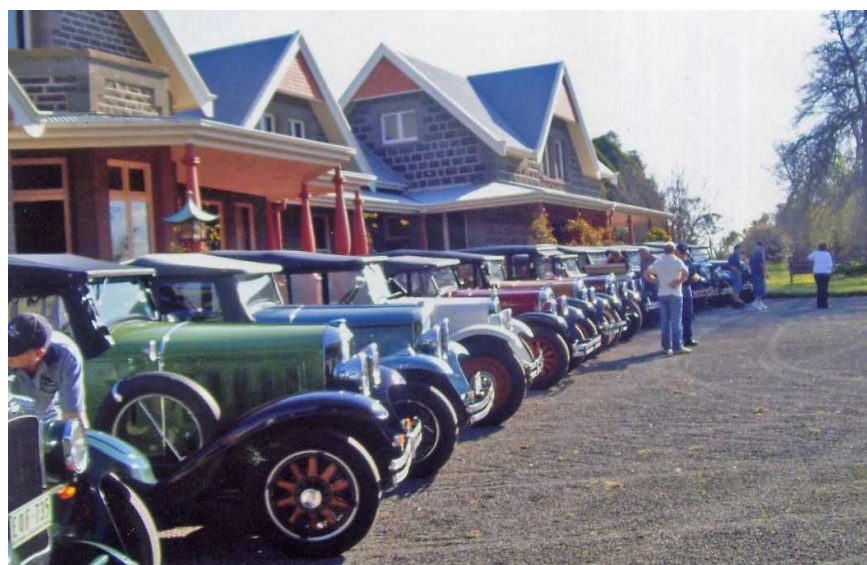
Some of the Oaklands lined up in front of "Purrumbete" homestead situated on the shore of Lake Purrumbete at Camperdown.