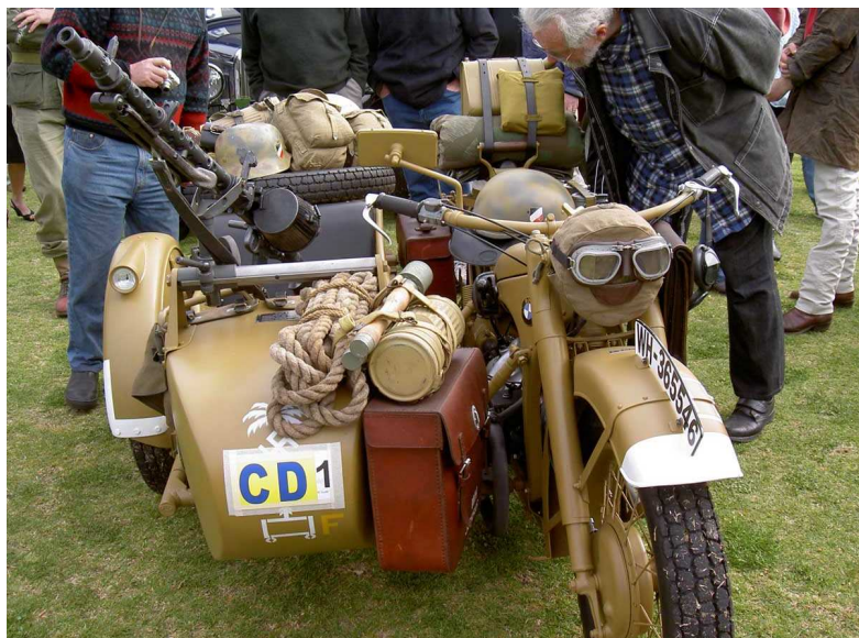
2008 Concours winner – 1941 BMW military outfit